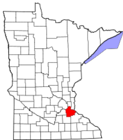
Location Map of Dakota County Minnesota