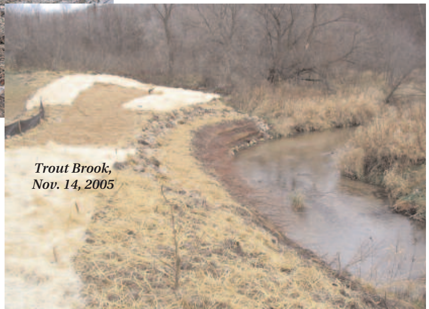
Trout Brook, Nov. 14, 2005