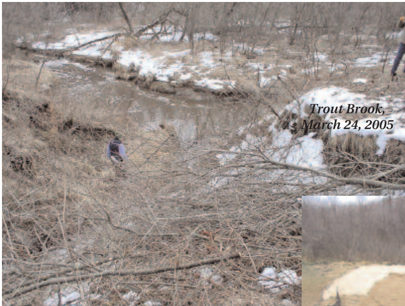
Trout Brook, March 24, 2005

In addition to providing technical assistance to implement conservation, the Dakota County Soil and Water