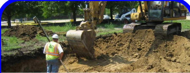
All equipment operated from outside of the cell to avoid construction compaction. A 4" gate valve allows for management of the flow rate and volume of treated stormwater discharged through the subdrain system into an existing catch basin.