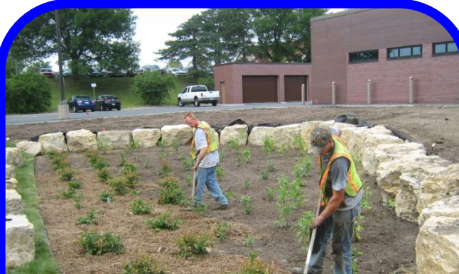
Curb cut elevations limit pool depth to 12 inches and provide gutter flow bypass high flow events. Native Dwarf-bush Honeysuckle, Black Chokeberry and Redosier Dogwood shrubs, lawn edging, a 3 inch layer of shredded wood mulch complete the cell.