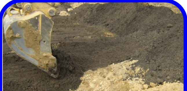
The permeability of the underlying soil within the cell was improved by loosening with a toothed bucket and mixing with Mix B soil.