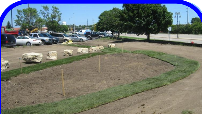
Turf sod was installed to minimize erosion and potential sediment contamination of the Mix B while inslopes were final graded. The boulders will prevent snow storage within the cell.